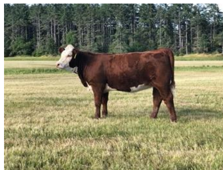
Tlell 6153 Katz 4K