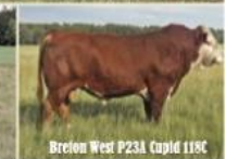
Breton West P23A Cupid 119C