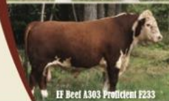
EF Beef A303 Proficient F233