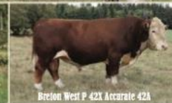
Breton West P 42X Accurate 42A